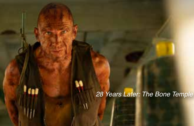
28 Years Later: The Bone Temple

For screening times, visit galadurham.co.uk