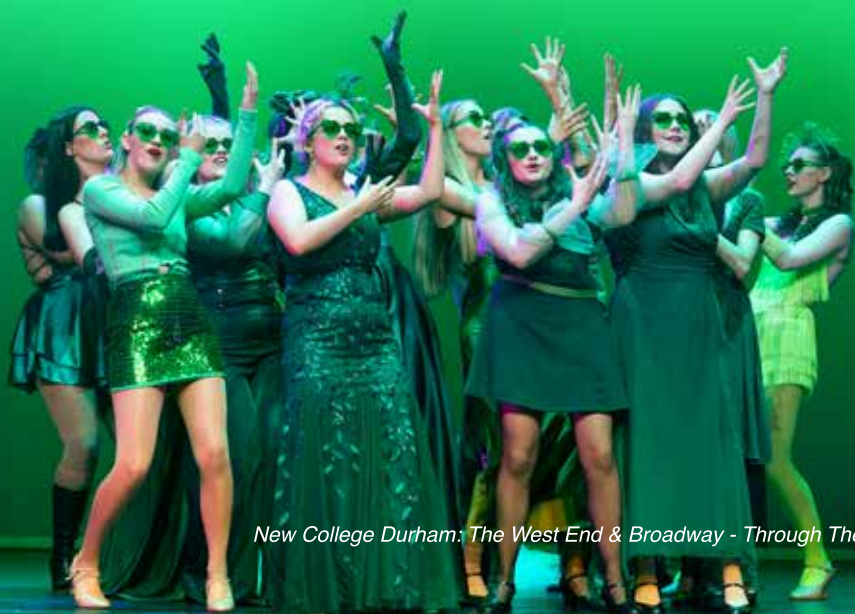
New College Durham: The West End & Broadway - Through The Ages.

Saturday 21 March, 12noon & Sunday 22 March, 10.30am | £10 (£16 weekend ticket)